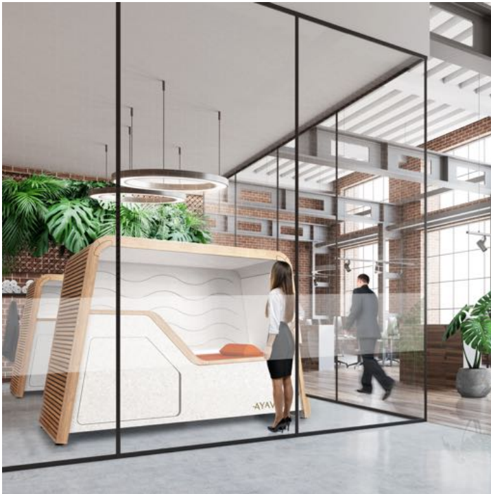
The AYAVAYA capsule can be placed anywhere and only needs to be connected to the main electricity network.